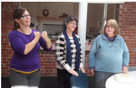
Enjoying look at the photos.