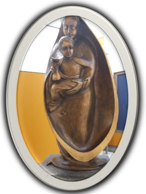
Statue: Our Lady of the Southern Cross Springfield

ALL: Whakamoemiti ki te Atua - Thanks be to God