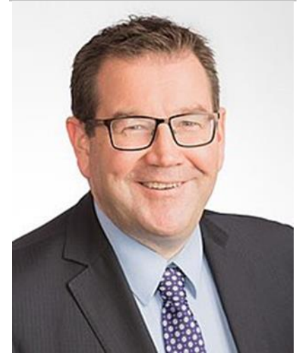
ABOVE: Former Deputy Prime Minister Grant Robertson.