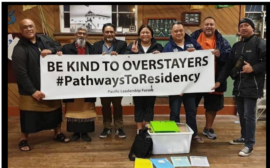
ABOVE: Members of the Pacific Leadership Forum promoting their petition to open up a pathway for overstayers.