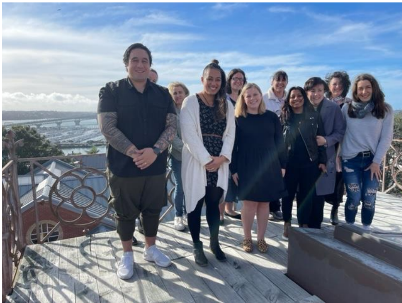
Teachers on the Roof of the Pompallier Centre

In keeping with the Declaration of Intent the Catholic Education Services Board and the Board of Auckland Common Fund Ltd are required to meet annually to review their strategic plans and review the operations of the two Boards. This meeting was held on 21 April 2021.