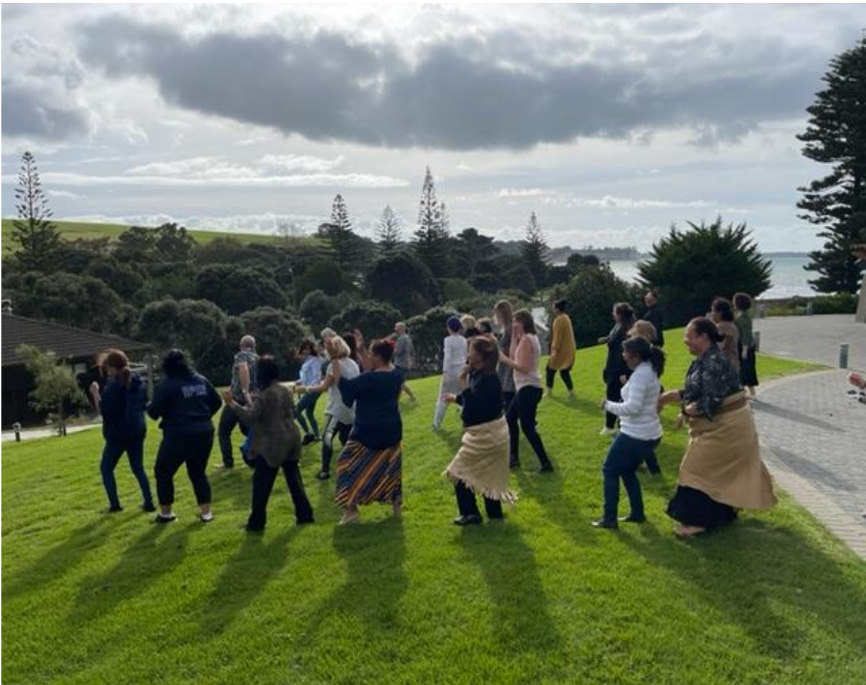
Dancing the Jeruselema at the Primary DRS Conference at Vaughan Park

In 2021 the inquiry process into the way CES works with schools, begun in 2020, continued. Inquiry questions under the four headings Formation, Teaching and Learning, Te Tiriti o Waitangi and Community were developed. Hui to meet with Principals, DRS's and Board members were planned and the first two with Central Auckland schools occurred in August. Unfortunately, the long Covid enforced lockdown in Auckland from late August till December prevented further hui. The work is planned to continue in 2022, with other geographical groupings of schools.