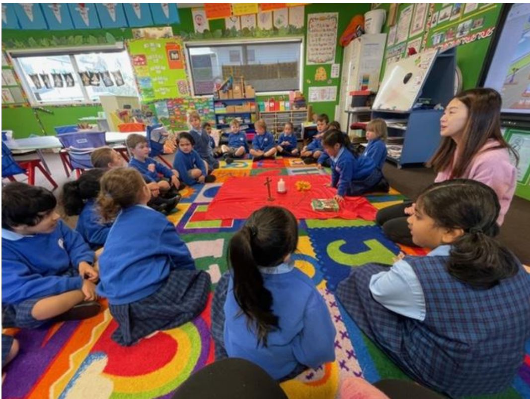
Prayer time at St Mary's Ellerslie

A full copy of the audited accounts is available on request.