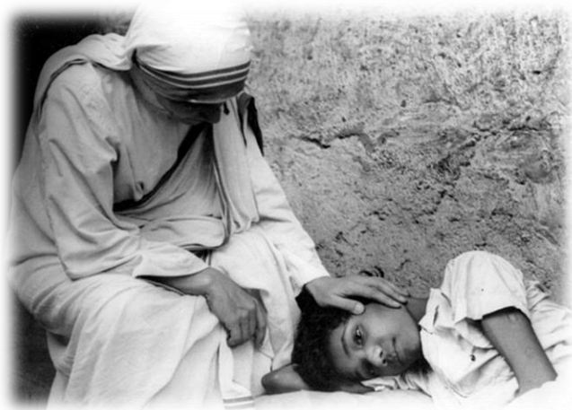
Mother Teresa with a sick child

The children re-join the assembly before the prayers over the gifts.