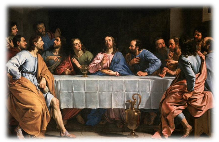
What would happen if we had no food or anything to drink? Together they keep us alive, and without their life-giving nourishment we would die. Jesus is the bread of life who shares himself with us in a special way during the Mass.

Exodus 24:3-8 Psalm 116 Mark 14:12-16, 22-26