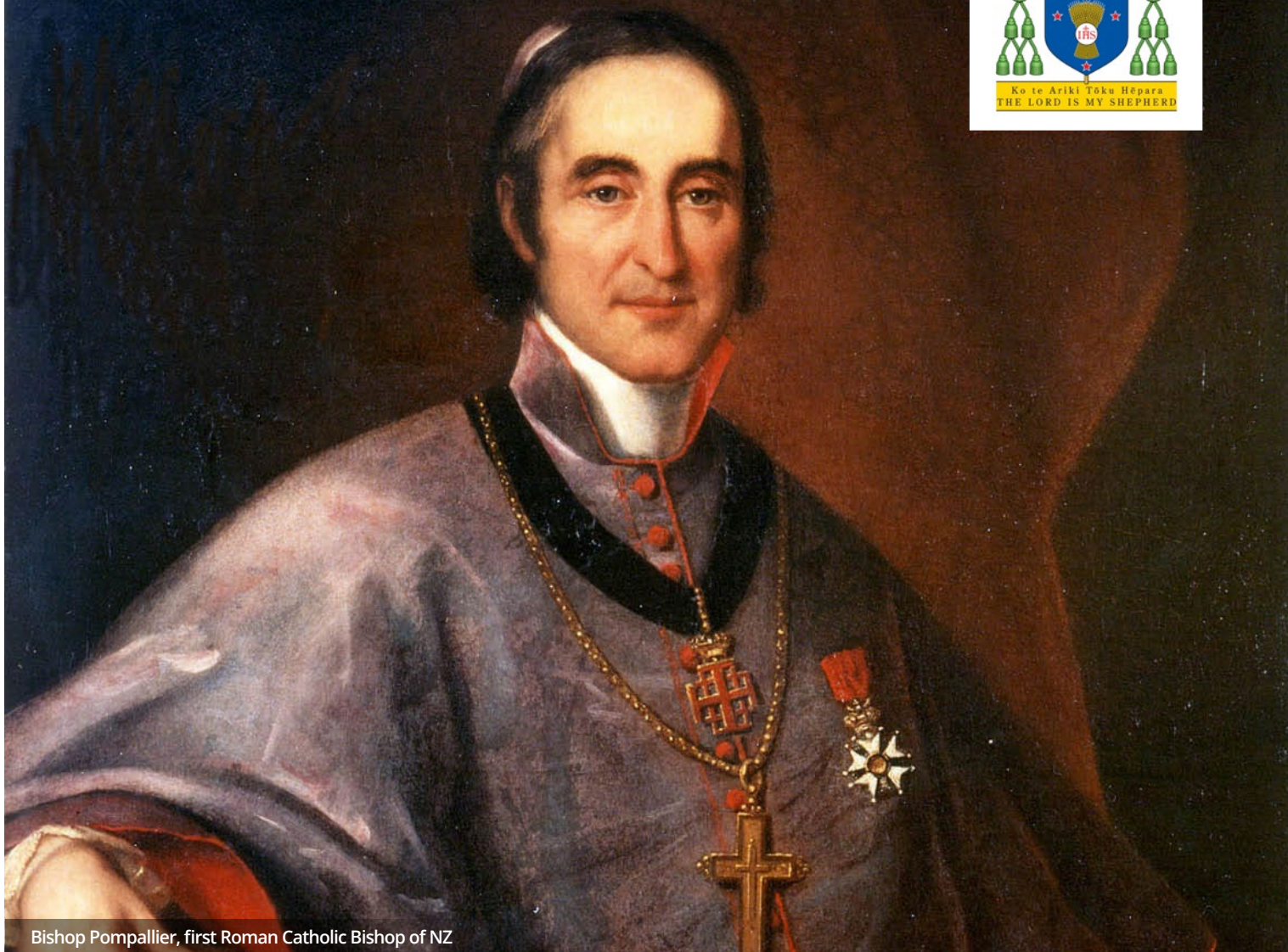
Bishop Pompallier, first Roman Catholic Bishop of NZ