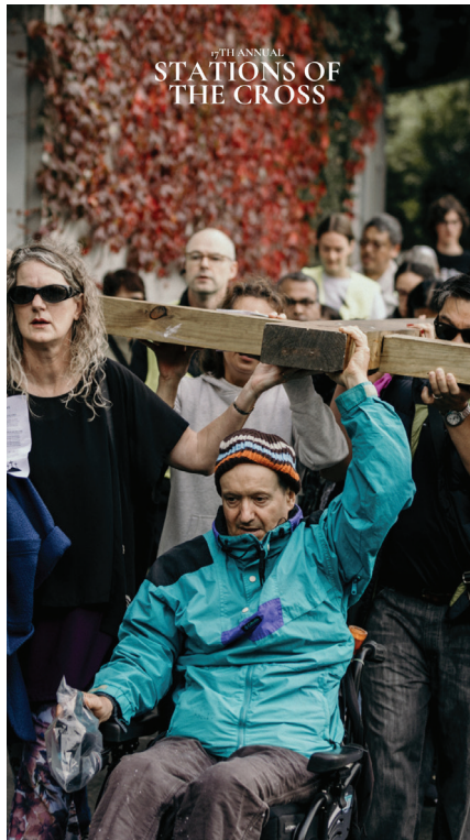
Despite the threat of a continuation of stormy weather, more than 700 pilgrims of hope walked and prayed the Stations of the Cross through Auckland's central city on Good Friday.

One of the practical ways this is being implemented is through the Diocesan Pastoral Council. Rather than just reading reports from communities and commenting, they pray with all that is sent in and then discern using spiritual conversations what the issues, concerns and celebrations of the diocese are. Three members are also undergoing training in leading synodal conversations facilitated through the Bishops Conference, so