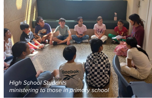
High School Students ministering to those in primary school