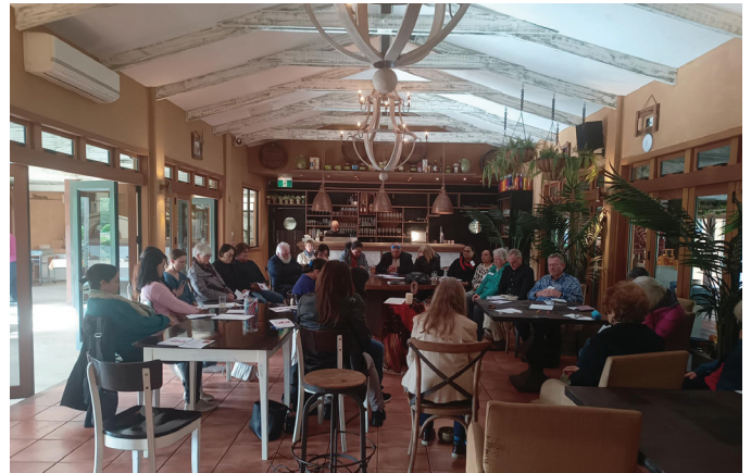
A "Be Refreshed" day retreat for the northern part of the diocese was recently held. Another retreat was scheduled for 5 July in Auckland.

This is where the Holy Spirit is active in our lives and our parishes, and we are strengthened from these. The Church needs all of us to be consistent in these areas, engaging together to help bring excitement and vibrancy to the parish community. When this happens, the parish spirit and the culture bless us through the Holy Spirit, fulfilling life and increasing faith.