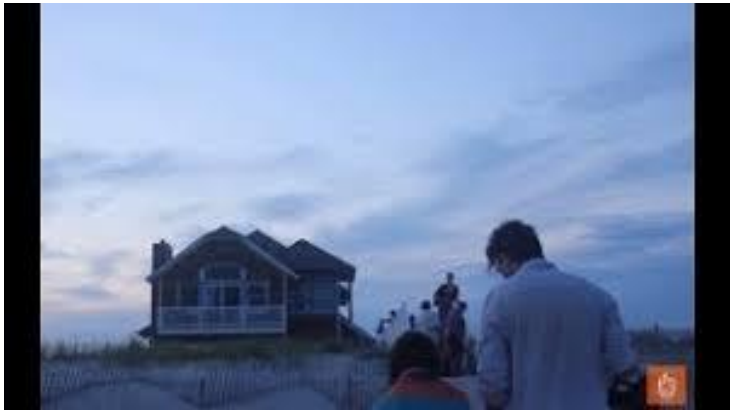
Click here and follow the Link