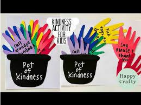
Click here and follow the Link