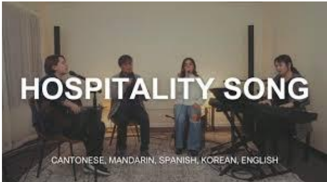
Click here and follow the Link