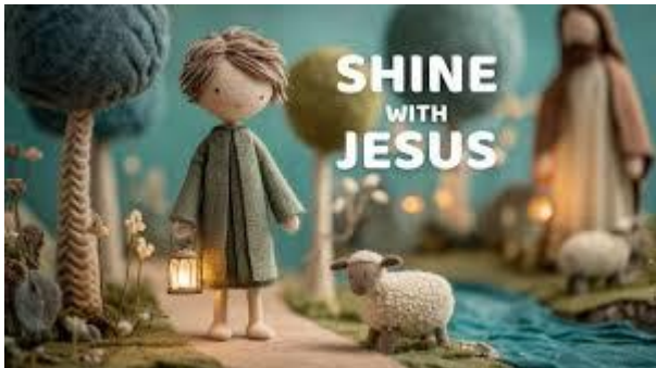
Click here and follow the Link