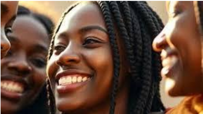
Click here and follow the Link