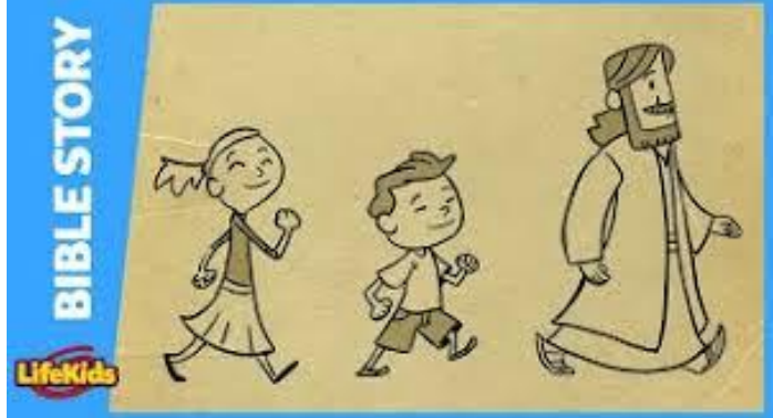
Click here and follow the Link