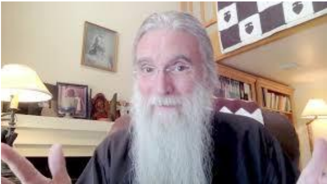
Click here and follow the Link