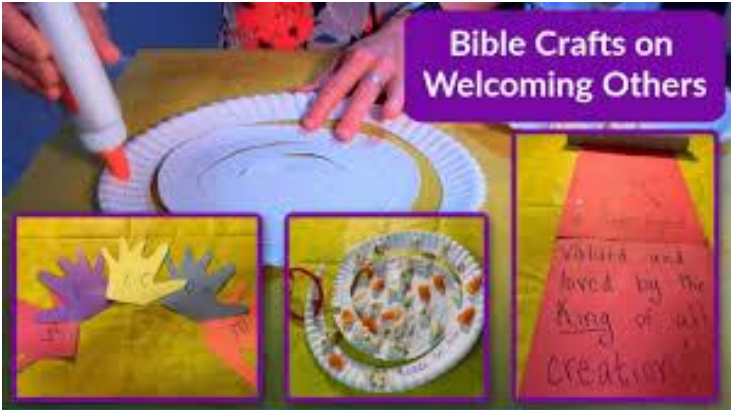
Click here and follow the Link